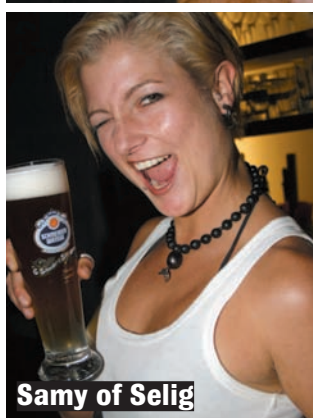
Samy of Selig