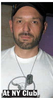
At NY Club