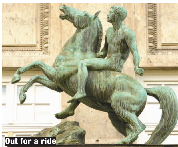
Out for a ride

A bit north of Munich, in Pleinfeld Bavaria, Riedel's Cafe (Nürnberg Strasse 3) is a short walk from the shores of Brambach Lake. Their shady beer garden with its small brook is perfect for taking a break in your travels to enjoy homemade ice cream (a specialty of host Ewald) or some small delicacy. On cool or wet days there's a warm and friendly atmosphere inside. With local swimming and bicycling in the summer and sledding in the winter, Riedel's Cafe is a year-round attraction. ▼