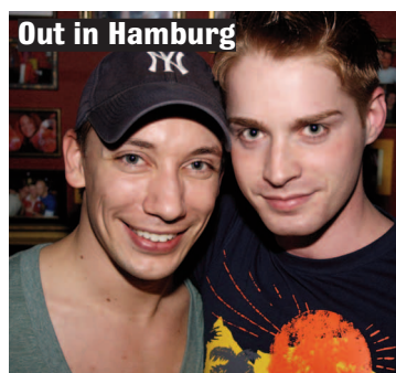
Out in Hamburg